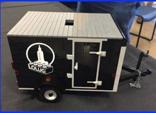
LOLUG's Donation Trailer