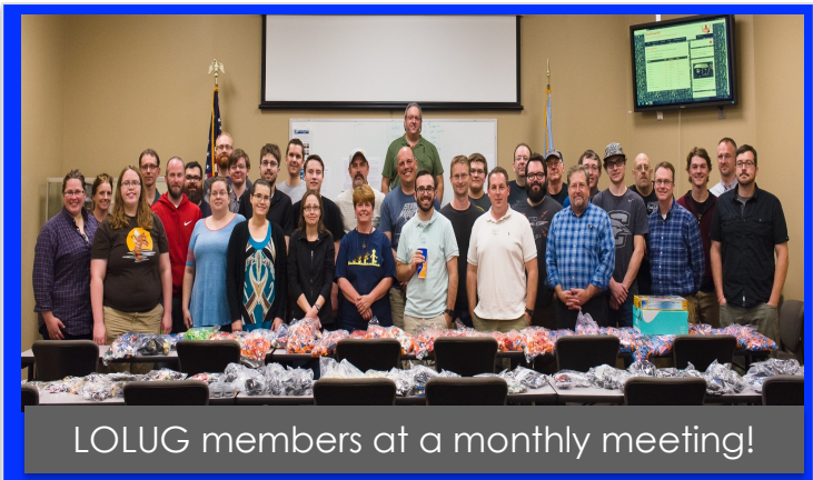
LOLUG members at a monthly meeting!

LOLUG will be displaying creations at Lauritzen Gardens in Omaha for two days! March 18 th and 19 th ! See you there!